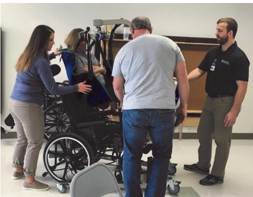
Occupational Therapy students are introducing transfer equipment to caregivers.

Students and faculty from Allen College and the University of Northern Iowa teamed together with the ALS (Amyotrophic Lateral Sclerosis) Association, Iowa Chapter to provide a caregiver training day on March 23. After learning about the impact that ALS can have on a