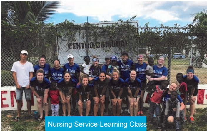
Nursing Service-Learning Class