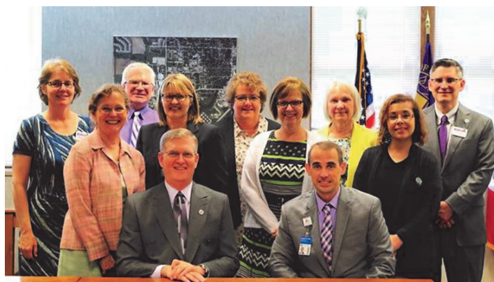
The presidents and academic leaders from both institutions were present for the signing of the agreement.

Individuals interested in earning the Graduate Certificate in Business Administration should contact the UNI MBA Office, which administers the program, at 316 Curris Business Building, Cedar Falls, IA 50614, (319) 273-6243 or Allen College at 1825 Logan Ave, Waterloo, IA 50703 (319) 266-2014.