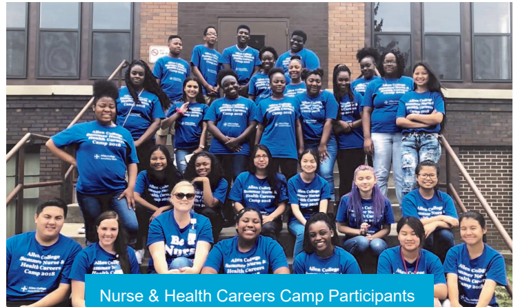
Nurse & Health Careers Camp Participants

While in the Dominican Republic, the students spent two days shadowing and working in a Women's and Children's hospital and the Air Force Hospital; and two days making home visits to the people living in severe poverty in la Piedra, as well as helping with two medical clinics (one in la Piedra and one in Jabacoa, DR). Students gained invaluable experience as they were immersed in the culture of the Dominican Republic and participated in lots of activities grounded in the community.